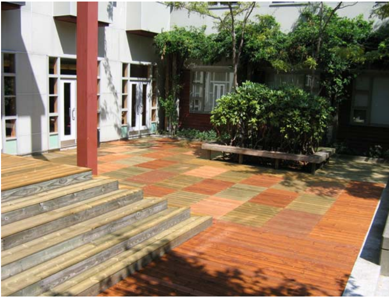
Figure 2 FPIinnovations courtyard deck

The boards were rated using a draft AWP standard for serviceability of decking, developed by FPIinnovations, for the following dimensional stability characteristics. Cupping, and length, depth and width of checks were measured individually for each sample on the top face, as follows: